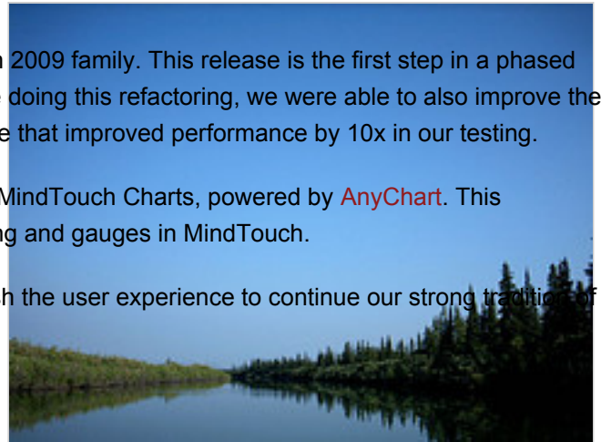
Lil' Noatak River

And is the case with all our releases, we have continued to polish the user experience to continue our strong tradition of providing a product that is incredibly easy to use.